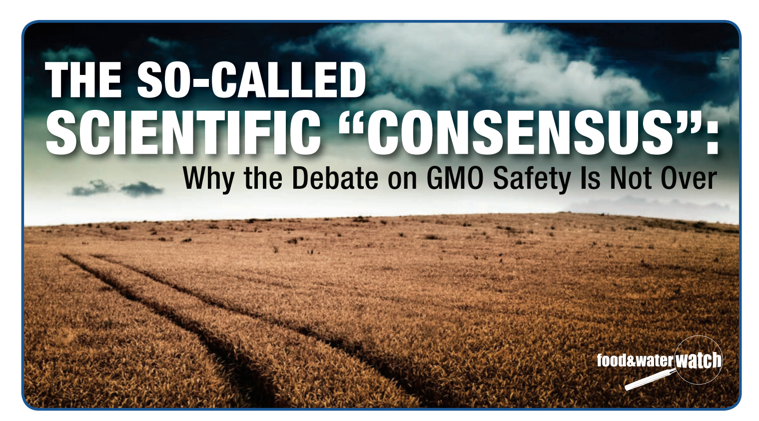
Issue Brief • September 2014

Biotechnology seed companies, aided by advocates from academia and the blogosphere, are using their substantial resources to broadcast the myth of a "scientific consensus" on the safety of genetically engineered crops (hereafter GMOs), asserting that the data is in and the debate is over. This public relations campaign, helped along by industry front groups, has caught the attention of some of the most visible news outlets in the country, with biotech advocates portraying GMO critics as akin to climate change deniers, out of step with science.<sup>1</sup>