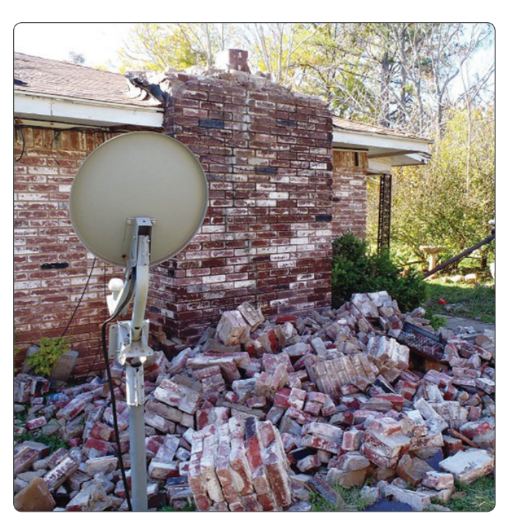
Residential damage from the magnitude 5.7 earthquake in 2011 that struck Prague, Oklahoma.

Scientists now believe that, by pumping large amounts of fluids underground, the oil and gas industry is largely to blame for the significantly increased frequency of earthquakes observed in the United States in recent years. The For decades, the central and eastern United States consistently registered about 20 magnitude 3.0 or greater earthquakes per year. The mid-2000s, this trend broke, and earthquake frequency increased, directly coinciding with the expansion of modern drilling and fracking. The In 2010, 2011 and 2012 combined, there were about 300 earthquakes of magnitude 3.0 or greater. In just the first half of 2014, Oklahoma alone registered about 200 magnitude 3.0 or greater earthquakes.