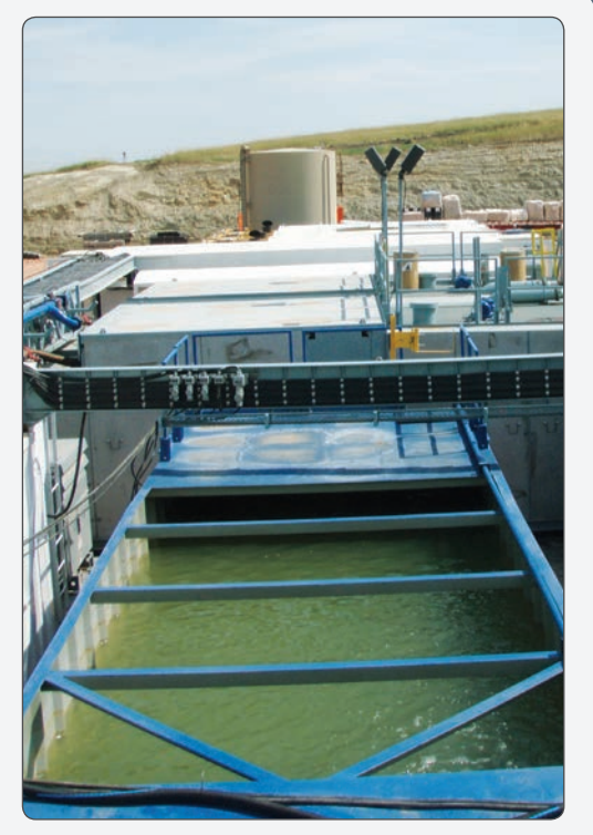
Fluid awaits injection at a fracking site.

Under UIC regulations, new Class II wells are subject to regulations that would require addressing the issue of frack hits, were it not for this loophole. The loophole thus explains how the issue of frack hits has remained beyond regulation, and highlights how the oil and gas industry, through its capture of U.S. energy policy, has erected barriers to protecting public health and the environment.