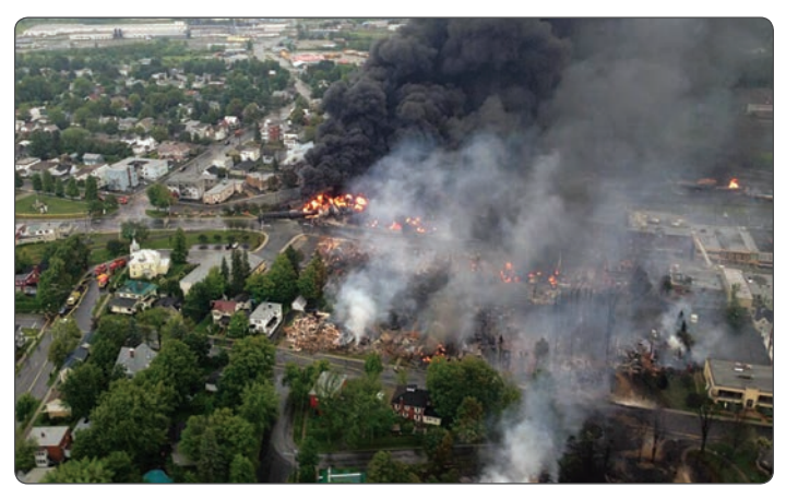
Aftermath of the Lac-Mégantic, Quebec, oil train derailment in July 2013.

Oil and gas industry earthquakes have taken many by surprise, but scientists have long known that injections (and withdrawals) of fluids beneath the surface can induce earthquakes.<sup>187</sup> Few, if anyone, however, anticipated the