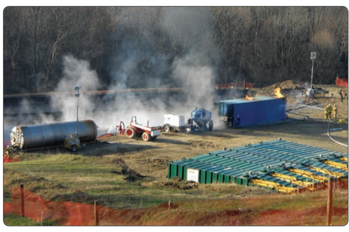
Battling a fracking wastewater liner fire in Hopewell Township, Pennsylvania.

More broadly, the social and economic disruptions experienced by communities include: diverse physical and mental health consequences<sup>299</sup>; increased demand on emergency